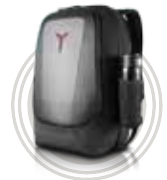
Lenovo Y Gaming Armored Backpack

* Example of Lenovo Legion catalogue naming convention