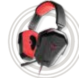
Lenovo Y Gaming Stereo Headset