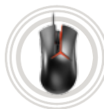
Lenovo Y Gaming Optical Mouse