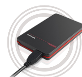
F310S USB 3.0 External Backup Hard Drive