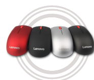
Lenovo 500 Wireless Compact Precision Mouse