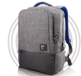
NAVA 15.6" On-trend Backpack