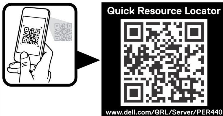
Figure 2. Quick Resource Locator for Dell EMC PowerEdge R440 system