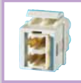
P.202 Fiber Modules