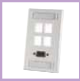
P.204 VGA Faceplates