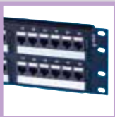
P.205 Category 6 & Category 5e Patch Panels