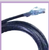
P.206 Category 6 & Category 5e Patch Cords