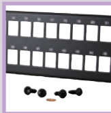
P.205 Patch Panel Kit