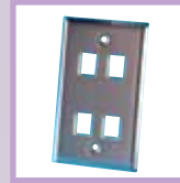
P.204 Stainless Steel Faceplates