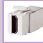
P.203 Multimedia Modules