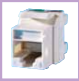
P.202 Keystone Jacks