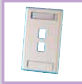
P.204 Plastic Faceplates