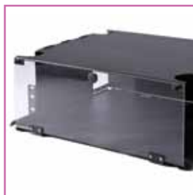
TechChoice Fiber Cabinets P.207