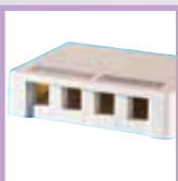
P.206 Surface Mount Boxes