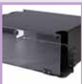
P.207 Fiber Splice Cabinets