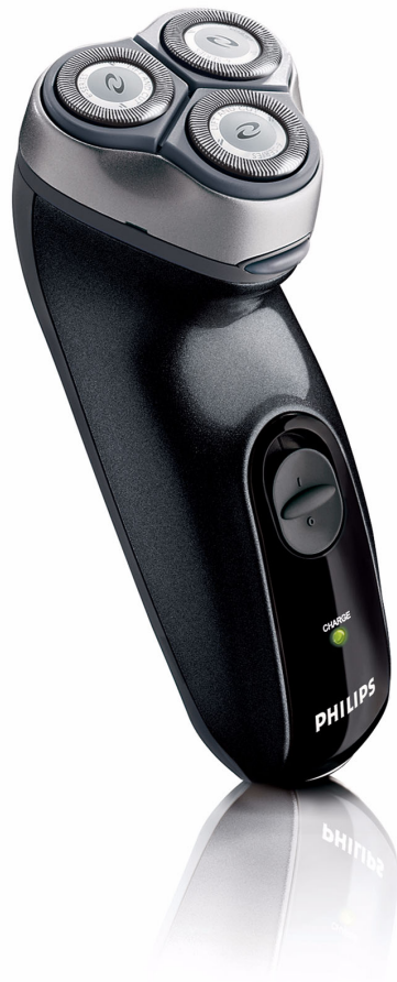
Philips 6000 series Electric shaver