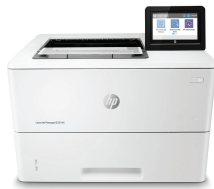
HP LaserJet Managed E50145dn

Dynamic security enabled printer. Only intended to be used with cartridges using an HP original chip. Cartridges using a non-HP chip may not work, and those that work today may not work in the future. http://www.hp.com/go/learnaboutsplies