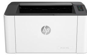
HP Laser 107w