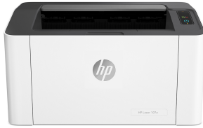
HP Laser 107a

Get productive print performance at an affordable price. Produce high-quality results, and print and scan from your phone. 1,2