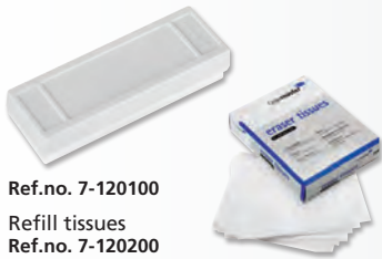
Ref.no. 7-120100 Refill tissues Ref.no. 7-120200