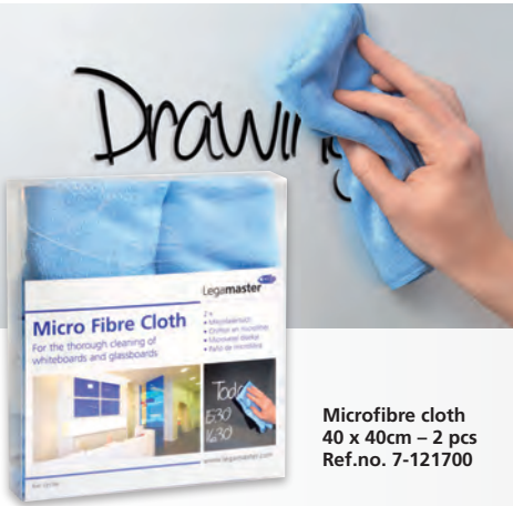
Microfibre cloth 40 x 40cm – 2 pcs Ref.no. 7-121700