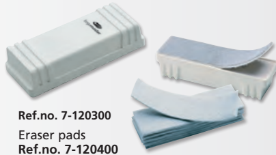
Ref.no. 7-120300 Eraser pads Ref.no. 7-120400