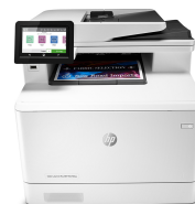
HP Color LaserJet Pro M479fwnw

This printer is intended to work only with cartridges that have a new or reused HP chip, and it uses dynamic security measures to block cartridges using a non-HP chip. Periodic firmware updates will maintain the effectiveness of these measures and block cartridges that previously worked. A reused HP chip enables the use of reused, remanufactured, and refilled cartridges. More at: http://www.hp.com/learn/ds