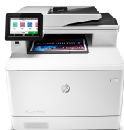
HP Color LaserJet Pro M479dw

Winning in business means working smarter. The HP Color LaserJet Pro MFP M479 is designed to let you focus your time where it's most effective—growing your business and staying ahead of the competition.