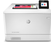
HP Color LaserJet Pro M454dw

This printer is intended to work only with cartridges that have a new or reused HP chip, and it uses dynamic security measures to block cartridges using a non-HP chip. Periodic firmware updates will maintain the effectiveness of these measures and block cartridges that previously worked. A reused HP chip enables the use of reused, remanufactured, and refilled cartridges. More at: http://www.hp.com/learn/ds