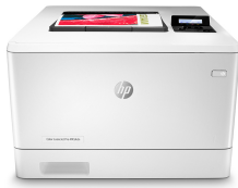
HP Color LaserJet Pro M454dn

Winning in business means working smarter. The HP Color LaserJet Pro M454 printer is designed to let you focus your time where it's most effective—helping to grow your business and staying ahead of the competition.