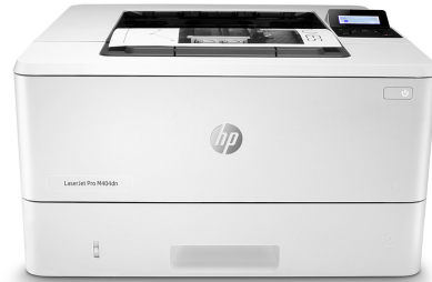
HP LaserJet Pro M404dn

Dynamic security enabled printer. Only intended to be used with cartridges using an HP original chip. Cartridges using a non-HP chip may not work, and those that work today may not work in the future. Learn more at: http://www.hp.com/go/learnaboutsupplies