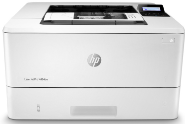
HP LaserJet Pro M404dw

Winning in business means working smarter. The HP LaserJet Pro M404 printer is designed to let you focus your time where it's most effective—helping to grow your business and staying ahead of the competition.