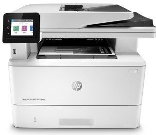
HP LaserJet Pro MFP M428fdn

Winning in business means working smarter. The HP LaserJet Pro MFP M428 is designed to let you focus your time where it's most effective – growing your business and staying ahead of the competition.