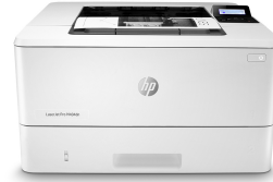
HP LaserJet Pro M404dn

This printer is intended to work only with cartridges that have a new or reused HP chip, and it uses dynamic security measures to block cartridges using a non-HP chip. Periodic firmware updates will maintain the effectiveness of these measures and block cartridges that previously worked. A reused HP chip enables the use of reused, remanufactured, and refilled cartridges. More at: http://www.hp.com/learn/ds