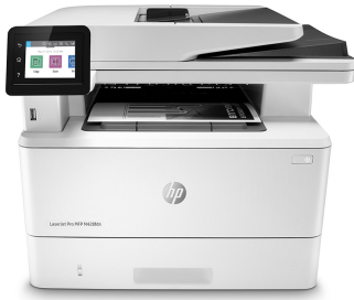
HP LaserJet Pro MFP M428fdn

Winning in business means working smarter. The HP LaserJet Pro MFP M428 is designed to let you focus your time where it's most effective – growing your business and staying ahead of the competition.