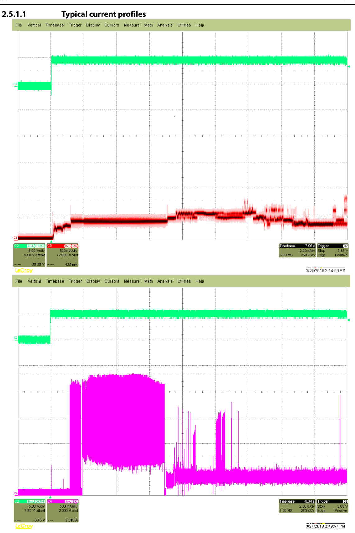
Figure 1. Typical 5V and 12V startup and operation current profiles