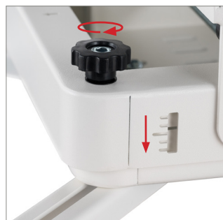
Micro-adjustment thumbwheels at 4-points for controlled and precise adjustment of the projector