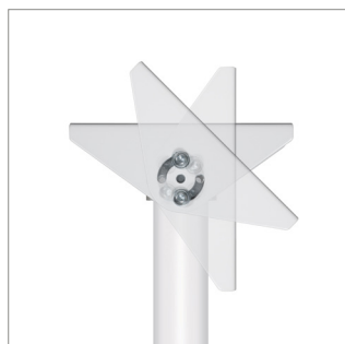
Adjustable ceiling plate is ideal for angled ceiling installations