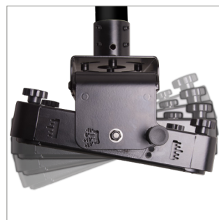
Features easy, incremented tilt adjustment