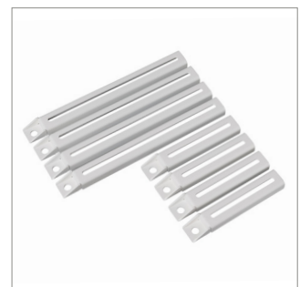
Optional extension legs are included to accommodate larger fixing patterns