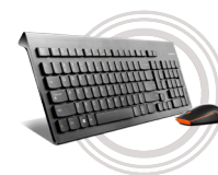
Lenovo 500 Wireless Combo Keyboard & Mouse