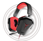
Lenovo Y Gaming Stereo Headset

* Example of Lenovo Legion catalogue naming convention