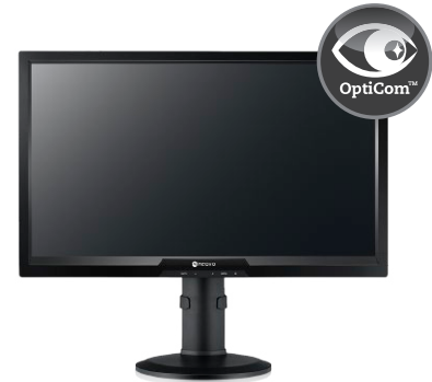
Advanced OptiCom™ Technology: Anti-blue light and flicker free for a more comfortable viewing experience