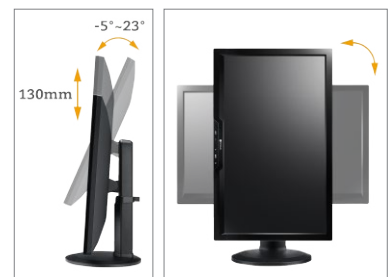
Ergonomically-designed stand allows users to tilt, pivot, swivel and adjust the height to its ideal position