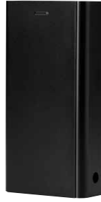
HP DM Power Supply Holder Kit v2 1