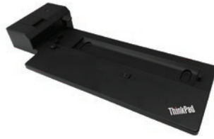
ThinkPad® Pro Docking Station