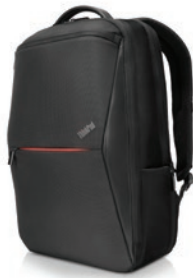
ThinkPad Professional 15.6" Backpack