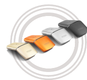
Lenovo Yoga Mouse