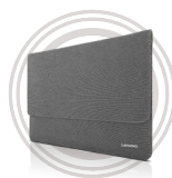
Lenovo Ultra Slim Sleeve