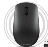
Lenovo 400 Wireless Mouse