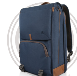
Lenovo 15.6" Laptop Urban Backpack B810