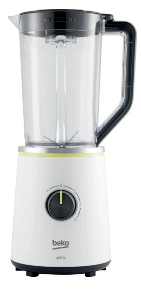
Table Blender User Manual