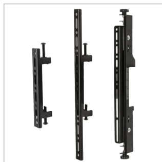
Choose from fixed or micro-adjustment interface arms