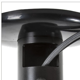
Integrated cable management to hide unsightly cables