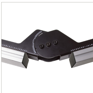
Angle up to +/-45° to create a concave or convex curved menu board