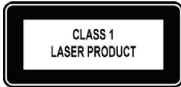
Figure 1. Class 1 laser product tag

⚠ WARNING: This equipment contains optical transceivers, which comply with the limits of Class 1 laser radiation.