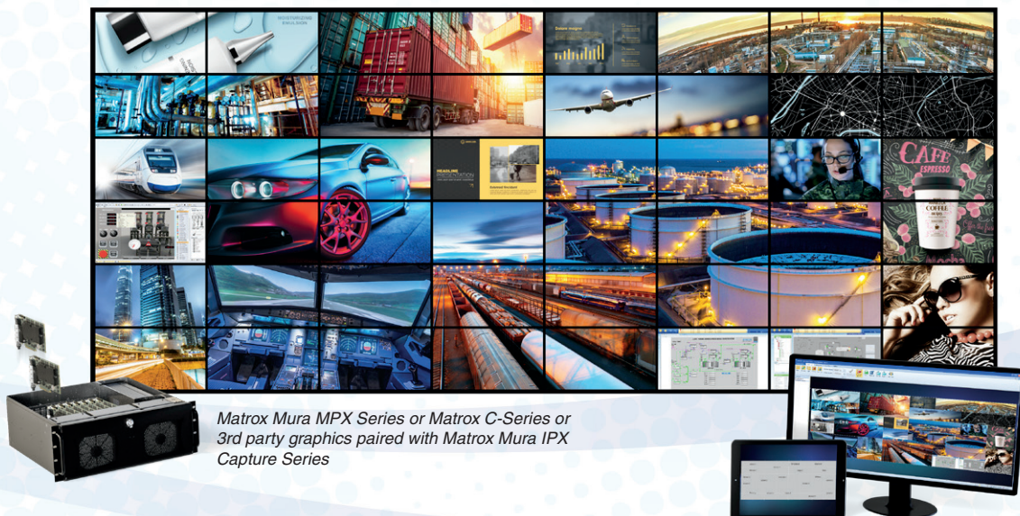
Matrox Mura MPX Series or Matrox C-Series or 3rd party graphics paired with Matrox Mura IPX Capture Series