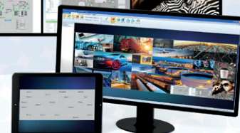
Matrox MuraControl for iPad and Matrox MuraControl for Windows