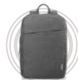
Lenovo 15.6" Laptop Casual Backpack B210