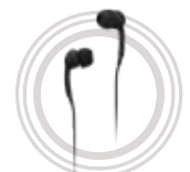
Lenovo 100 In-Ear Headphone