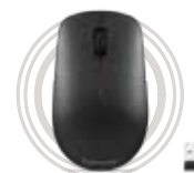
Lenovo 400 Wireless Mouse