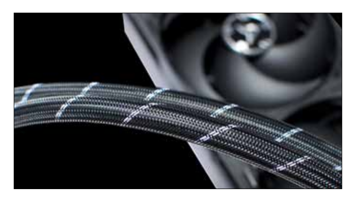
Maintenance-free Water Loop The water loop is sealed, therefore no water or additives have to be refilled.

The Liquid Freezer II Series features an all-new, in-house developed PWM-controlled pump with a copper base, improved efficiency, low power usage and quiet operation.