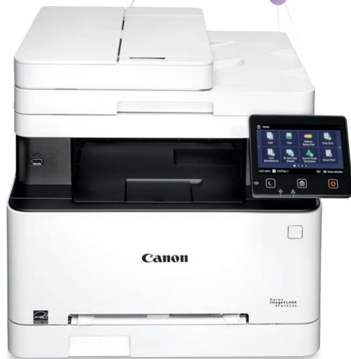
imageCLASS MF642Cdw Item Code: 3102C012