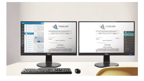
EasyRead mode for a paper-like reading experience