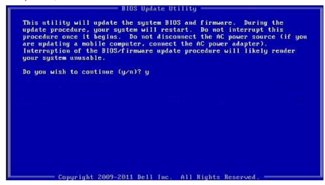
Figure 1. DOS BIOS Update Screen