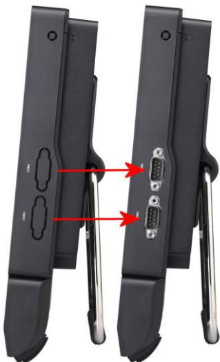
Shuttle XPC all-in-one P20U (also P22U, P51U, P52U)