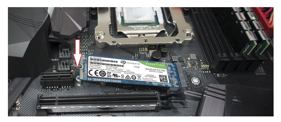
Figure 3: Seagate M.2 SSD in the M.2 Slot

8. Insert the BarraCuda 510 SSD with the pinside going into the M.2 slot and the label side facing the top at a 30 degree angle.