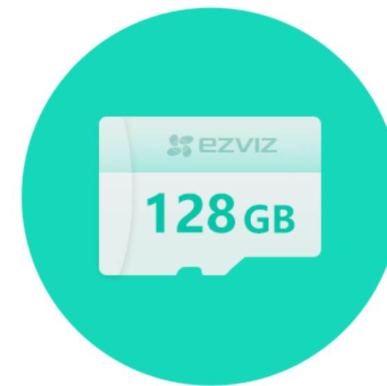
Both the C3A and WLB Support MicroSD Card

Save your recordings with flexible and secured solutions. Both the C3A and WLB come with a built-in MicroSD card slot that can store up to 128 GB of recorded data. You can also save your images to the EZVIZ Cloud for additional back-up. (Cloud storage service is only available in certain markets. Please verify the availability before making any purchase.)