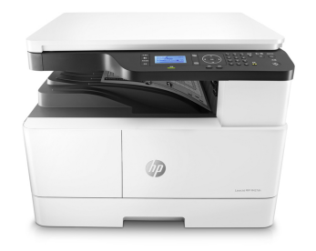
HP LaserJet MFP M437dn