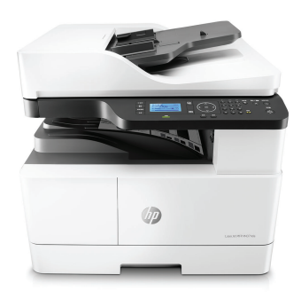
HP LaserJet MFP M437nda