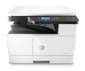
HP LaserJet MFP M437n

Surpass your office printer expectations with the speed, quality, and efficiency of the M437 series office printers.