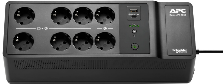
Model shown: BE1050G2-GR