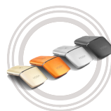
Lenovo Yoga Mouse