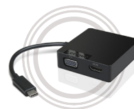
Lenovo USB-C Travel Hub