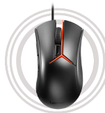
Lenovo Y Gaming Optical Mouse