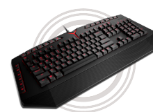
Lenovo Y Gaming Mechanical Switch Keyboard