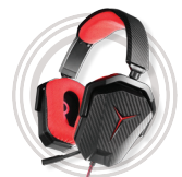
Lenovo Y Gaming Stereo Headset

* Example of Lenovo Legion catalogue naming convention