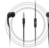
Lenovo 100 In-Ear Headphone