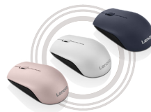
Lenovo 520 Wireless Mouse