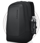
Lenovo 15.6" Laptop Casual Backpack B210