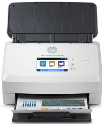
HP ScanJet Enterprise Flow N7000 snw1

Give your office high-volume scanning performance. HP Scan Premium helps you save time and capture confidently. Achieve black-and-white scan speeds up to 75 ppm/150 ipm 1 . Recommended for 7,500 pages per day.