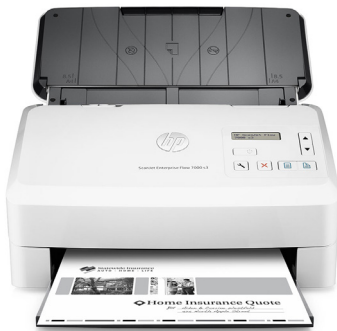
HP ScanJet Enterprise Flow 7000 s3