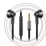
Lenovo 500 Extra Bass In-ear Headphones