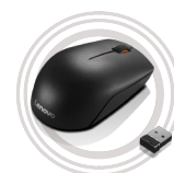
Lenovo 300 Wireless Compact Mouse