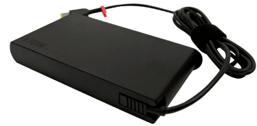
New Slim ThinkPad® 230W AC Adapter