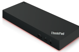
ThinkPad® Thunderbolt™ Workstation Dock