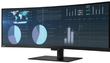
ThinkVision® P44w Monitor