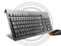
Lenovo 500 Wireless Combo Keyboard and Mouse

* Example of Lenovo IdeaCentre catalogue naming convention