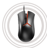
Lenovo Y Gaming Optical Mouse