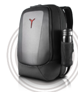
Lenovo Y Gaming Armored Backpack

* Example of Lenovo Legion catalogue naming convention