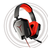
Lenovo Y Gaming Stereo Headset