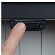
Wired remote control