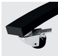
Smooth running & lockable castors