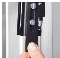
Pull & release locking brackets for easier mounting of display