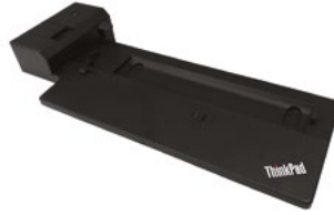
ThinkPad Pro Docking Station