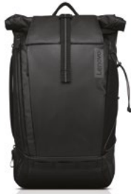
Lenovo 15.6" Commuter Backpack