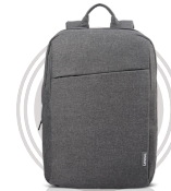
Lenovo 15.6" Laptop Casual Backpack B210