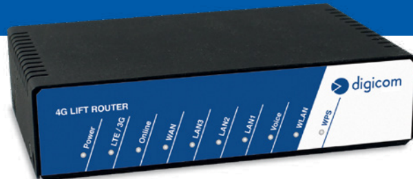
4G Lift Router Code 8D5860