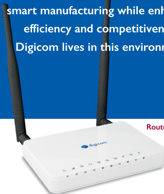
Router 4G LTE Voice Code 8E4615

The fourth industrial revolution boosts smart manufacturing while enhancing efficiency and competitiveness. Digicom lives in this environment.